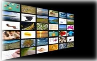
Slika 14: TV danes. (8.7.2012)

One area of change is television. Some changes have been improvements. Some changes, on the other hand, have been __3__. When I started school, most people didn't have a television; TV was just beginning to get __4__. My father decided to go all out and buy a 16 inch black and white Motorola set. I still remember watching the Lone Ranger save people from the __5__ guys on that awesome electronic machine. That was exciting!