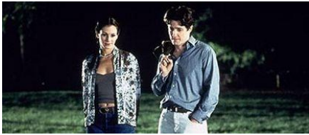
Slika 6: Notting Hill

My local cinema always seems to have at least one good film on, and when I watch a film for the first time I'd rather see it at the cinema than on DVD. Films feel different in the cinema, don't they? You can get really involved in the film when you're sitting in the dark, in silence, free from interruptions. Mind you, someone's mobile phone rang in the middle of the last film I saw – is there anything more irritating than that?