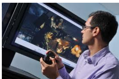
Slika 10: Video igre

Video games have existed for about 40 years, but until the late 1970s most of them were (1) _____ large and heavy metal casings, so you normally only found them in amusement arcades. (2) _____ has come a long way since then, of course, and now fans of video games can play them at home, using only a small console and their television set. There are also lots of hand-held video games that people can play (3) _____. The names of games systems such as Game Boy, PlayStation and Xbox have become well-known, not least to parents whose children prepare optimistic wish lists of birthday and Christmas (4) _____ they would like to receive.