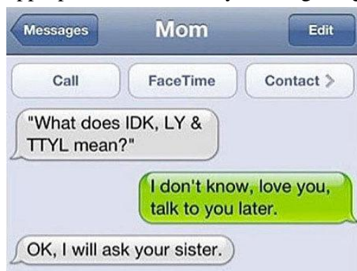
Slika 21: SMS.

Some studies suggest that Standard English is already changing because of text and email language. One study has even suggested that 'hello' and 'goodbye' could disappear from the English language during the 21 st century because so many people now use 'hey' or even 'yo' at the start of texts and informal emails, and 'laters' at the end.