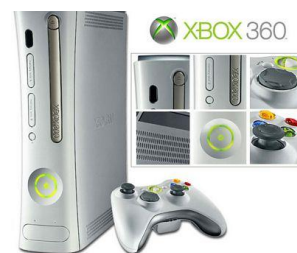
Slika 11: XBOX. (8.7.2012)

On the (12) _____ side, some studies have suggested that electronic games help people to think clearly and make quick decisions. You could even help with language learning, for example in the way that non-native speakers of English quite often play games containing characters who only speak in English.