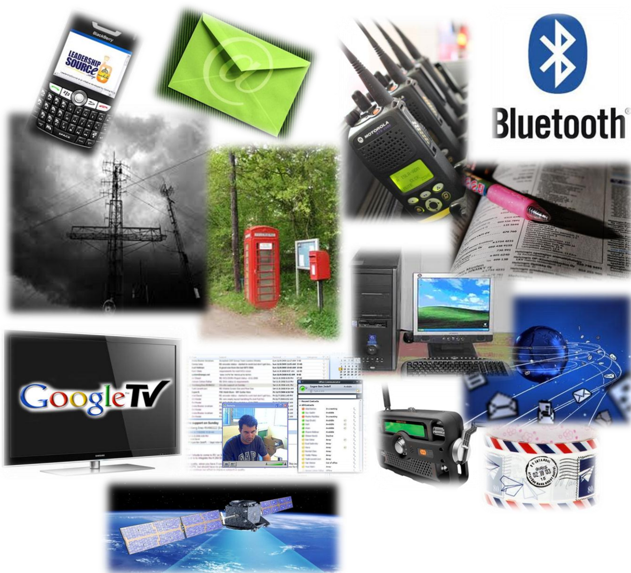
Slika 12: Sredstva komuniciranja.

Učno gradivo je nastalo v okviru projekta Munus 2. Njegovo izdajo je omogočilo sofinanciranje Evropskega socialnega sklada Evropske unije in Ministrstva za šolstvo in šport.