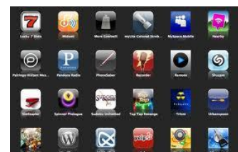
Slika 17: Aplikacije.

Smartphones come with some apps already built in – GPS, a calendar, weather forecasts and YouTube are common examples – but there are a huge number of extra apps that can be downloaded, with dozens of new ones invented every day.