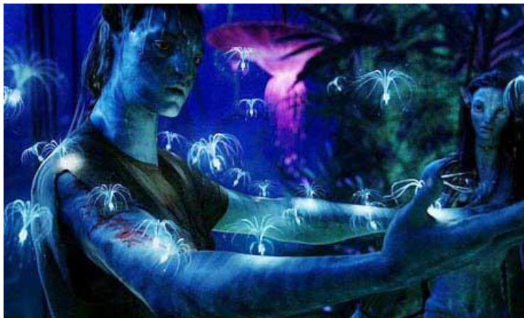
Slike 3-5: Scene iz filma.