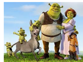
Slika 7: Shrek. (8.7.2012)

When I go to the cinema I usually watch something light-hearted like a comedy or an animation. A lot of the animations in the last few years have been for adults as well as kids – for example the Shrek films, or more recently, Ratatouille . I go to the cinema to relax after a hard day at work, so I'm not often in the mood for films with complicated plots that you can't follow unless you really concentrate. Tense dramas or thrillers aren't really my thing, and I don't like noisy action films either. As for horror films, I've avoided them ever since the last one I saw, which gave me nightmares for about a week afterwards!