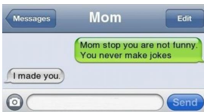
Slike 22-26: SMS sporočila.