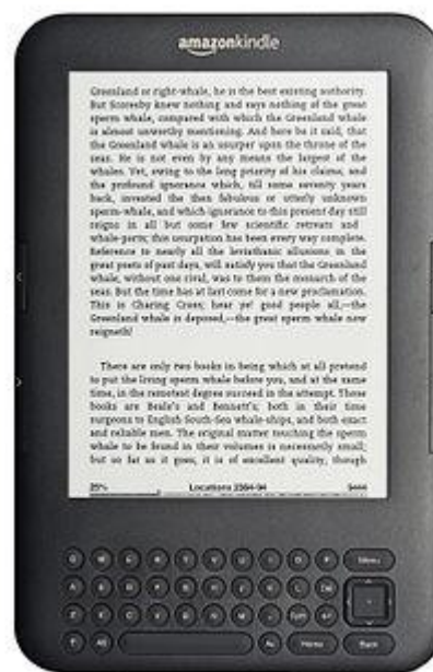
Slika 2: Amazon Kindle.

In the 1990s, the general availability of the Internet made transferring electronic files much easier, including e-books. Numerous e-book formats emerged and proliferated, some supported by major software companies such as Adobe with its PDF format, and others supported by independent and open-source programmers. Multiple readers followed multiple formats, most of them specializing in only one format, and thereby fragmenting the e-book market even more. Due to exclusiveness and limited readerships of e-books, the fractured market of independent publishers and specialty authors lacked consensus regarding a standard for packaging and selling e-books.