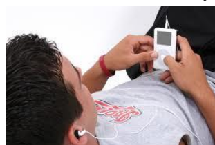
Slika 9: iPod. (8.7.2012)

S CDs are over-priced. I don't see why we shouldn't share tracks with friends.