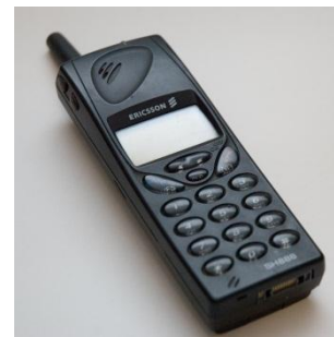
Slika 15: Mobilni telefon

Ken: Ha ha, very funny. It still works fine, you know. It's not the latest model, like yours, but unlike you I know I don't need a mobile phone that can take pictures or access the internet. I don't need to check my emails when I'm on the bus, and nor do you. No one does. Did you feel your life was empty before they invented the phone you have now? Of course you didn't.