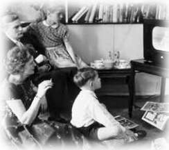
Slika 13: TV nekoč. (8.7.2012)

You really have to get very old before you realize you're old. I'm in my middle fifties and I don't feel old yet. However, sometimes I look back at my childhood and __1__ things to the way life is for __2__ kids. Some things have certainly changed.