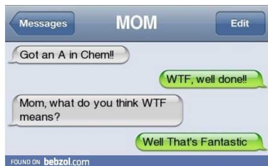
Slika 20: SMS.

While some people think text language is good way of saving time, others think it is lazy and that it has a bad effect on language. In Britain many teachers complain that some students don't know that using text speak in their schoolwork isn't appropriate, and that they are forgetting how to use Standard English.